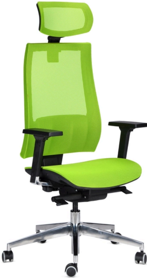
THE PHOTO MAY INCLUDE OPTIONAL